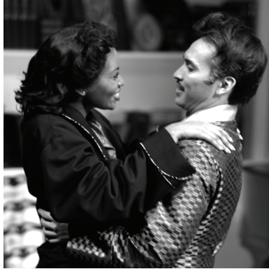
Noel Coward's Present Laughter

The rigorous training includes work in a range of types and styles of performance, including non-realistic, realistic, classical and contemporary plays. The program is intense and demanding, with actors working from 9-5, Monday-Friday, with an additional 25 hours per week spent in rehearsals. The overall aim of the program is to provide students with the practical skills necessary to fully reveal their artistic ideas. The PATP is consistently ranked among the very best graduate training programs in the nation.