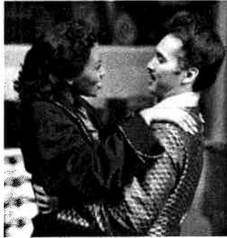
Noël Coward's Present Laughter

The PATP is a three-year conservatory program leading to a Master of Fine Arts degree, designed to prepare students for careers in the professional theatre. Ten actors are chosen every year from national auditions of more than 1,000 candidates. The rigorous training includes work in a range of types and styles of performance, including non-realistic, realistic, classical and contemporary plays. The program is intense and demanding, with actors working from 9-5, Monday-Friday, with an additional 25 hours per week spent in rehearsals. The overall aim of the program is to provide students with the practical skills necessary to fully reveal their artistic ideas. The PATP is consistently ranked among the very best graduate training programs in the nation.