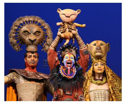
Upcoming: The Broadway Musical:

How Immigrants, Queers, Jews, and African-Americans Created America's Signature Art Form Spring Quarter, VLPA & DIV